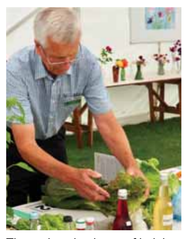
The serious business of judging the produce entered into the Grundisburgh Village Show. More photos and a report of the show can be seen on the back page of this issue.